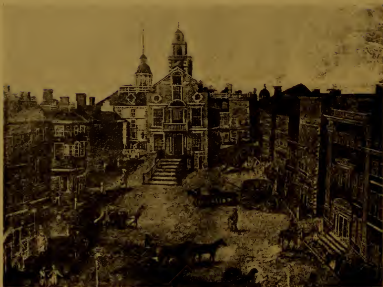
View of upper part of State Street in 1804